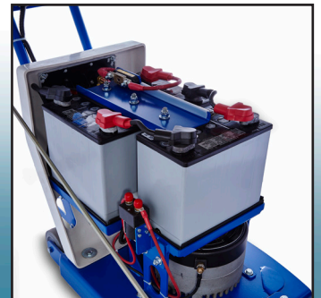
Powered by three 12 V batteries for zero emissions and quiet operation.