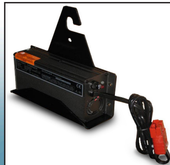
The fully automated battery charger supplied with the edger can be conveniently wall mounted or alternately hung from the fine adjustment handle.