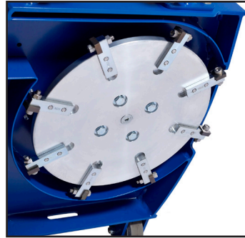
Wide 14-inch (356 mm) cut includes eight 8-sided cutters.