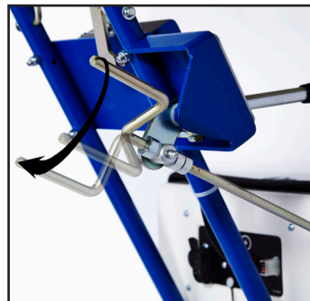
Blade height adjustment is easily performed with readily accessible handle.