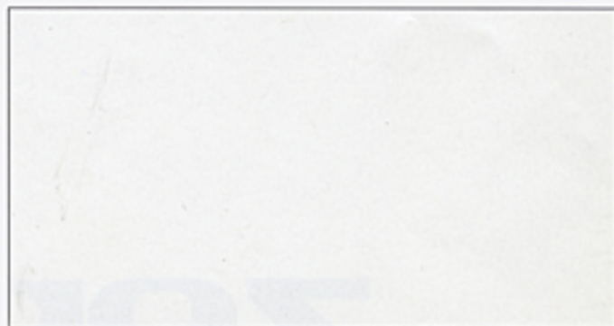
ZAMBONI and the configuration of the Zamboni® ice resurfer are registered trademarks of Frank J. Zamboni & Co., Inc.

Eigentalsstrasse 1, Box 123, CH-8309 Nuerensdorf Phone: +41 1 837 01 91 Fax: +41 1 837 01 80